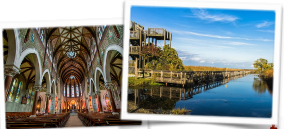
Picture of Boardwalk along Marsh at Point Pelee and St. Peter's Cathedral Basilica