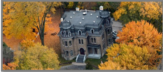
Glanmore National Historic Site